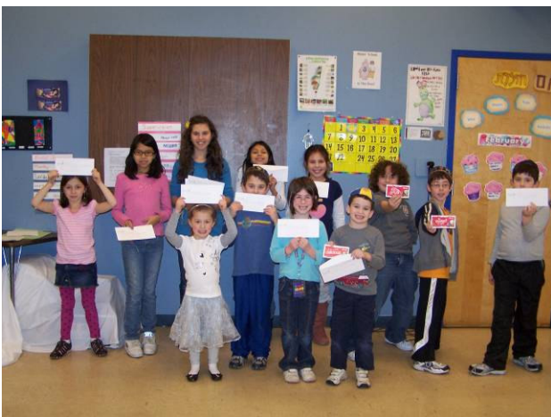
Students who sold all their Money Mania and Sports Sweepstakes tickets were awarded with Friendly's ice cream cone coupons at lunch on Thursday. See who won each raffle prize on the next page.